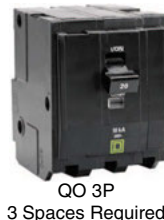
Table 1.1: Plug-On Circuit Breakers