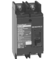
QDP22200TM 2P, Bolt-on Type Circuit Breaker